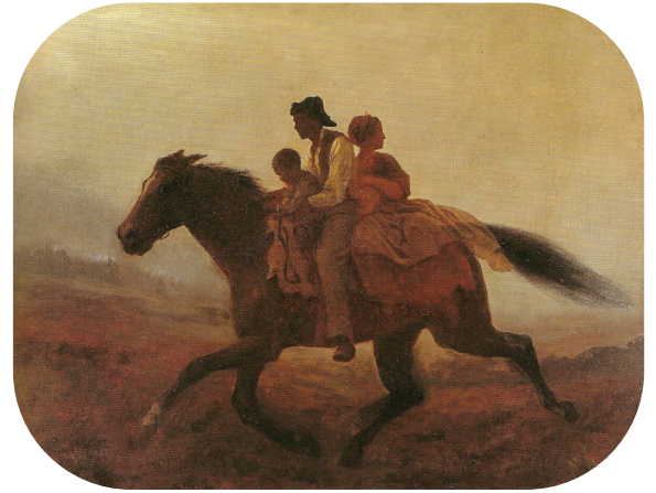
Ride for Liberty – The Fugitive Slaves, by Eastman Johnson

Started in the early 1800s, the Underground Railroad ended when slavery was abolished near the end of the Civil War. At least 30,000 people used the secret system to make their way to freedom.