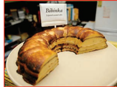
Bibinka is a popular Christmas treat.

In the Philippines, people celebrate many different holidays during the Christmas season. The season begins on December 16. People attend an early morning church service each day for nine days. This series of services are called Simbang Gabi in the Filipino language. It is a very important time for the people of the Philippines. When services are over, many people will buy special holiday treats from shops. One treat is bibinka, which is a rice and egg cake.